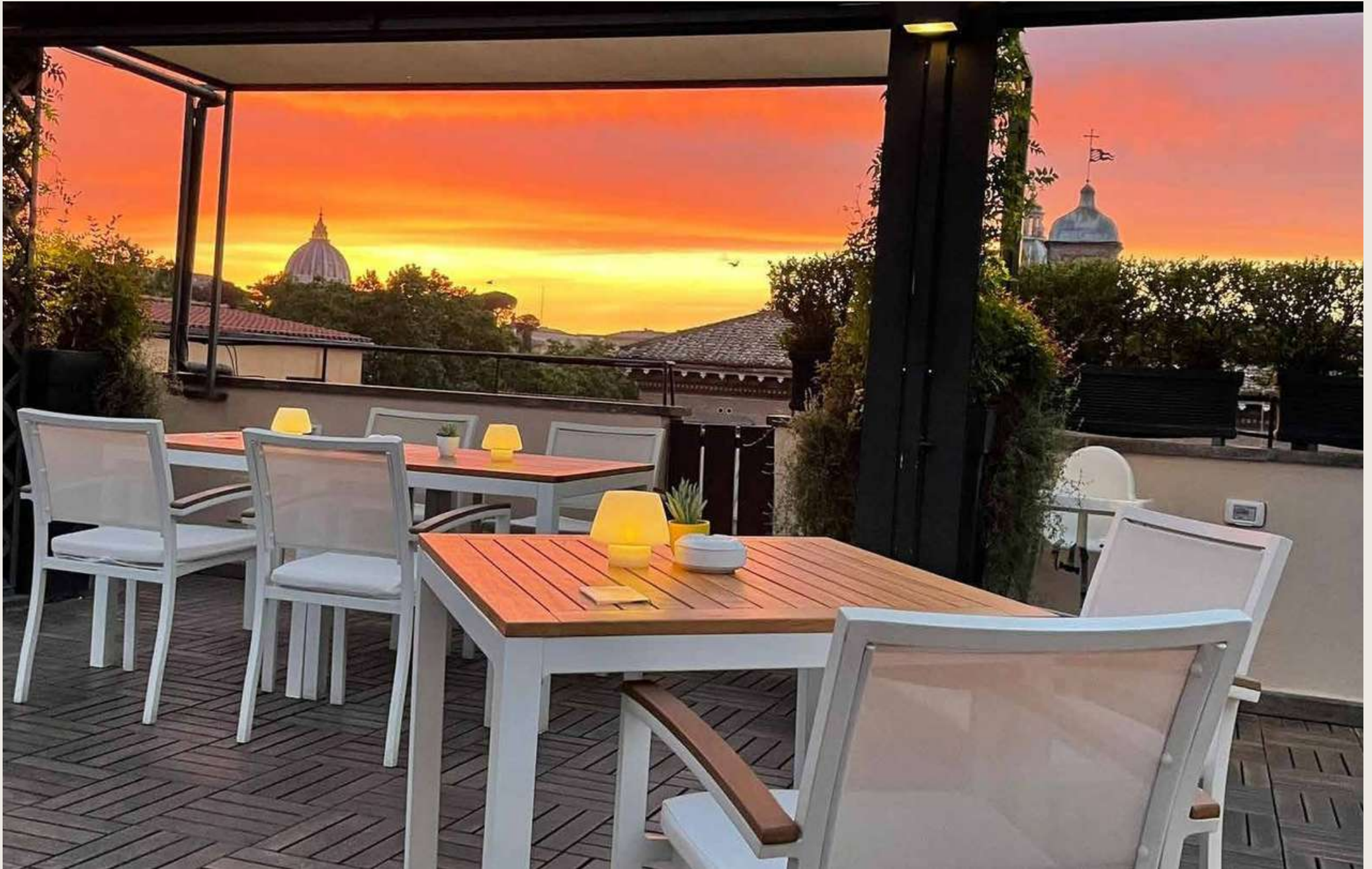
Roof Terrace at sunset