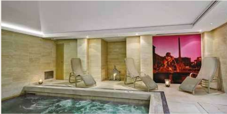
St. George Spa