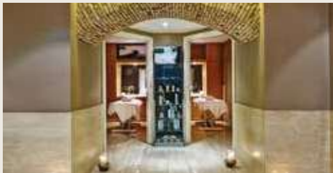
St. George Spa - treatments

This is the sight boasted by the Hotel Indigo Rome - St. George and its Health & Beauty Centre, where the professionalism of the management is focused on a single objective: the sublimation of the senses.