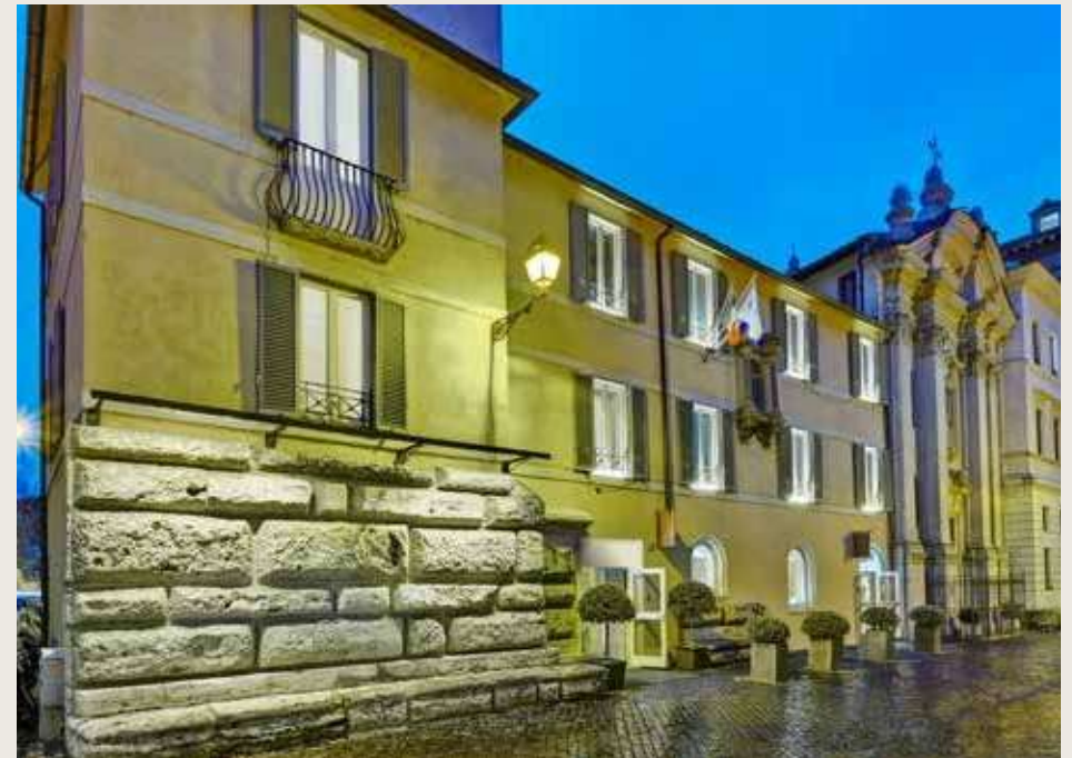
Hotel Exterior by night

He commissioned Donato Bramante, the designer of St. Peter's Basilica, to plan the new thoroughway and to create a centrepiece - the 'Palazzo dei Tribunali' - to be the hub of the city's justice system. This was never finished but the great stone seats, which are all that remain of the courthouse, have been incorporated into the Hotel Indigo Rome - St. George and are affectionately known as the 'Sofas' of Via Giulia.