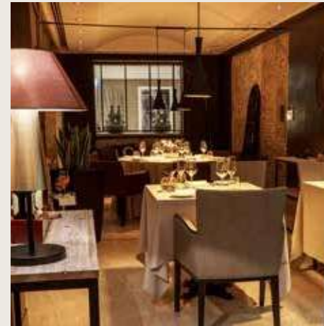
I Sofà Restaurant