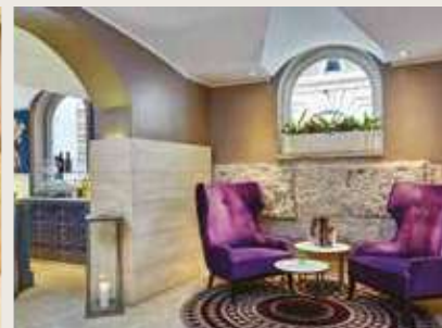
I Sofà Bar

Our building was originally designed in around 1508 by Donato Bramante, regarded as one of the greatest architects of the Italian Renaissance. The famous travertine stones still greet you as you enter our hotel. Inside our lobby you'll notice subtle lighting, bold colour accents and features influenced by classic Italian style. Beautiful murals of Bramante's work will take you back in time to the area's past.