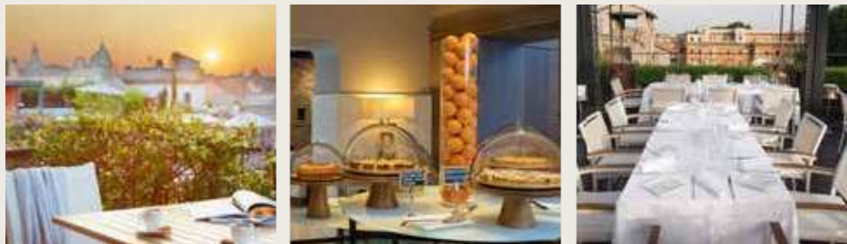
I Sofà Bar Restaurant & Roof Terrace