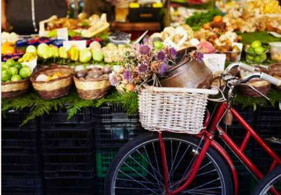
Campo de' Fiori Market

We aim to inspire our guests and help them discover our distinctive neighbourhoods around the globe, providing stories for them to share. They are curious and unique with an eye for detail. They enjoy discovery, fashion and style, work and travel. They seek the reliability and dependability of a globally recognised brand with distinct experience of a boutique.