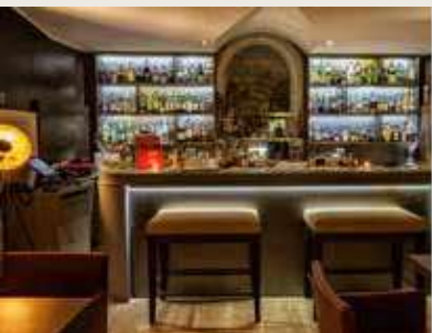
I Sofà Bar