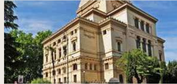
Synagogue of Rome