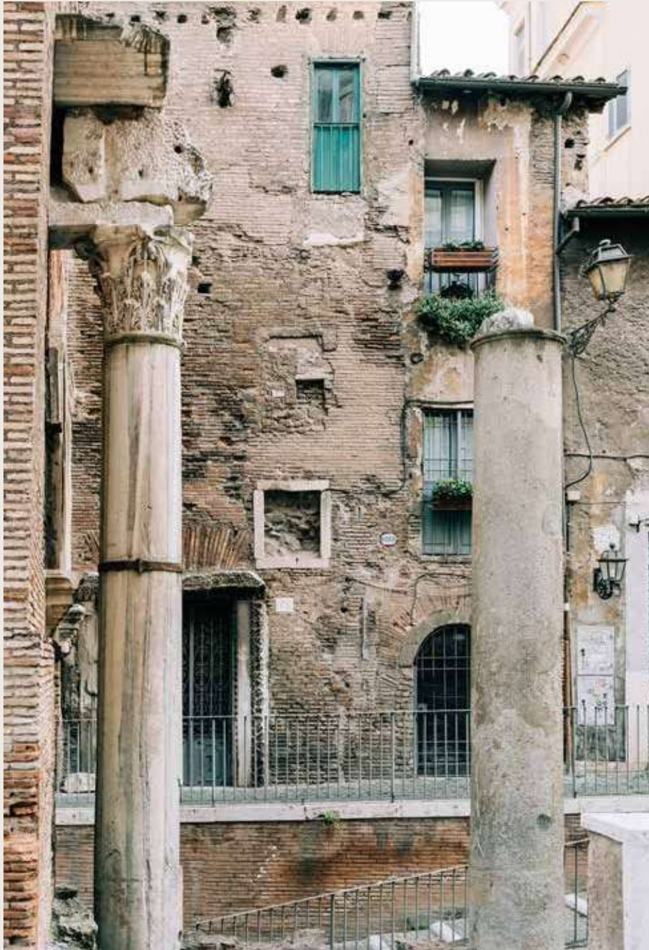
Portico d'Ottavia - Jewish Ghetto