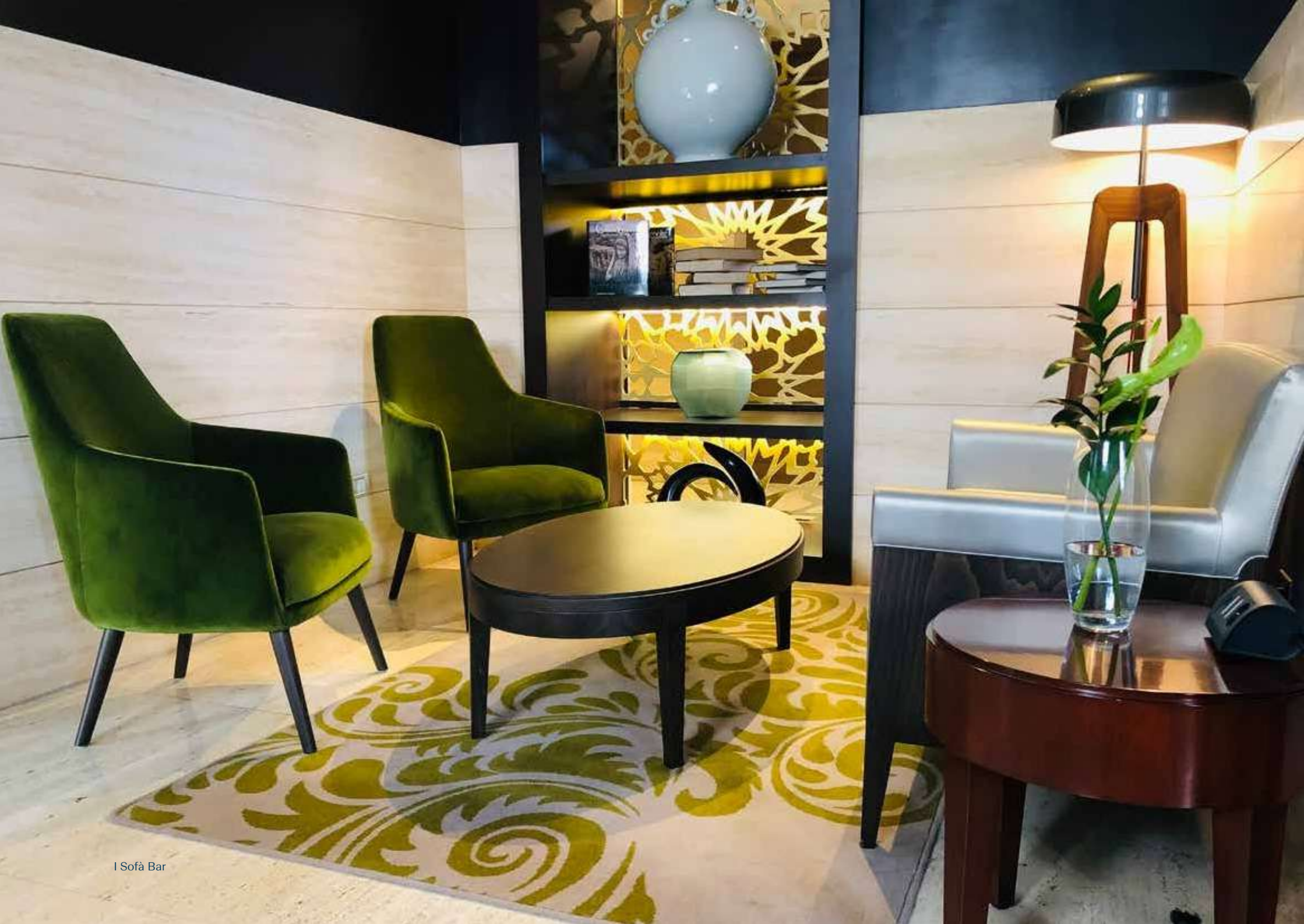
I Sofà Bar