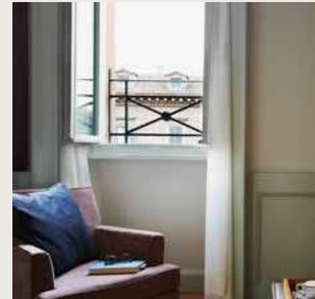
Junior Suite - living