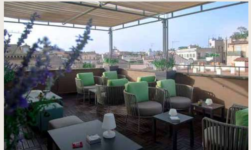
I Sofà Bar