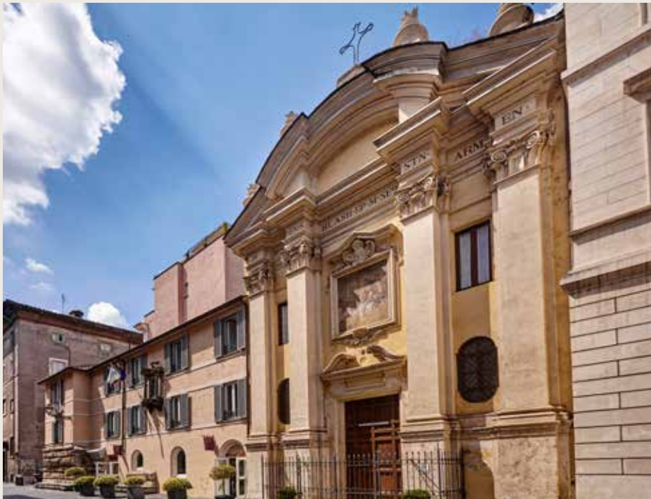
Hotel Exterior by day

The street itself - Via Giulia - has been a byword for craft and invention for centuries. Surrounded on all sides by a new generation of ambitious artists and artisans, Hotel Indigo Rome - St. George is at the very heart of a vibrant community of creators.