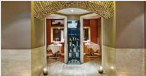
St. George Spa - treatments

This is the sight boasted by the Hotel Indigo Rome - St. George and its Health & Beauty Centre, where the professionalism of the management is focused on a single objective: the sublimation of the senses.