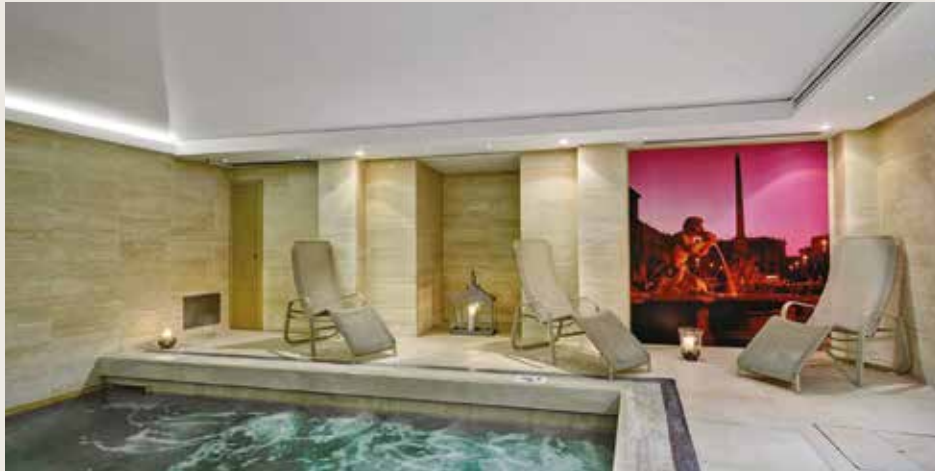
St. George Spa