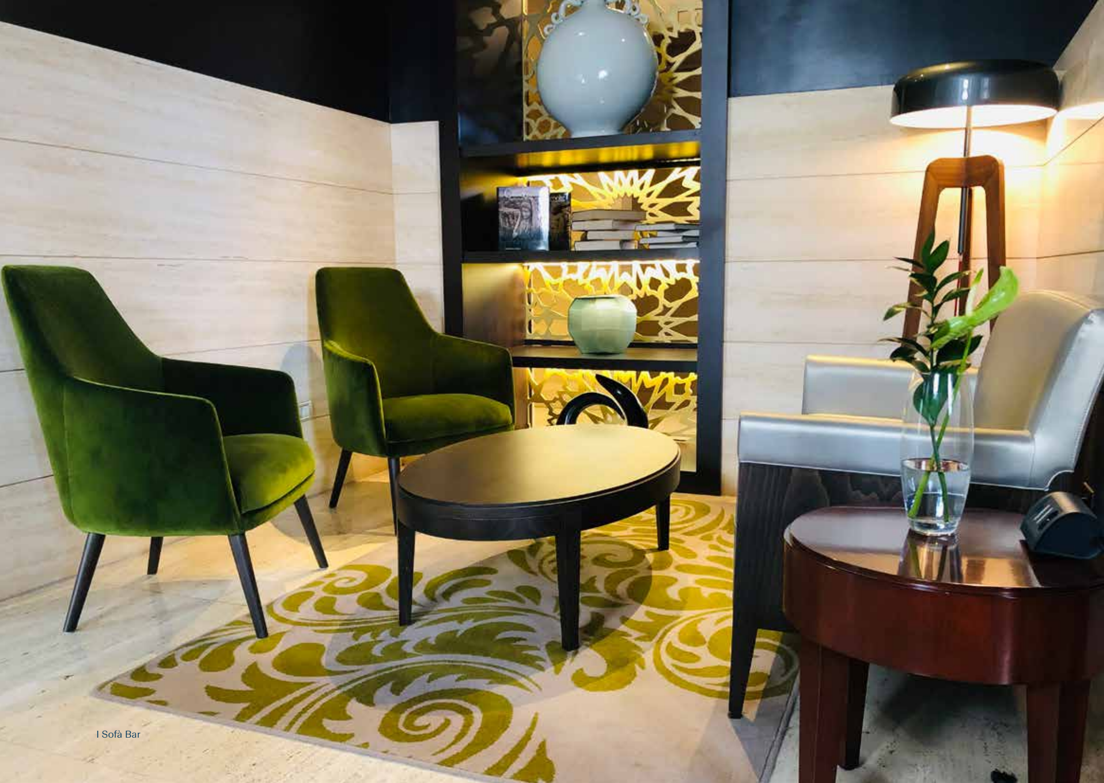
I Sofà Bar