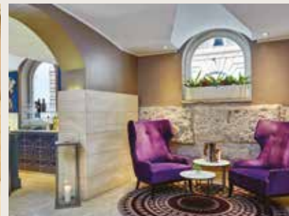
I Sofà Bar