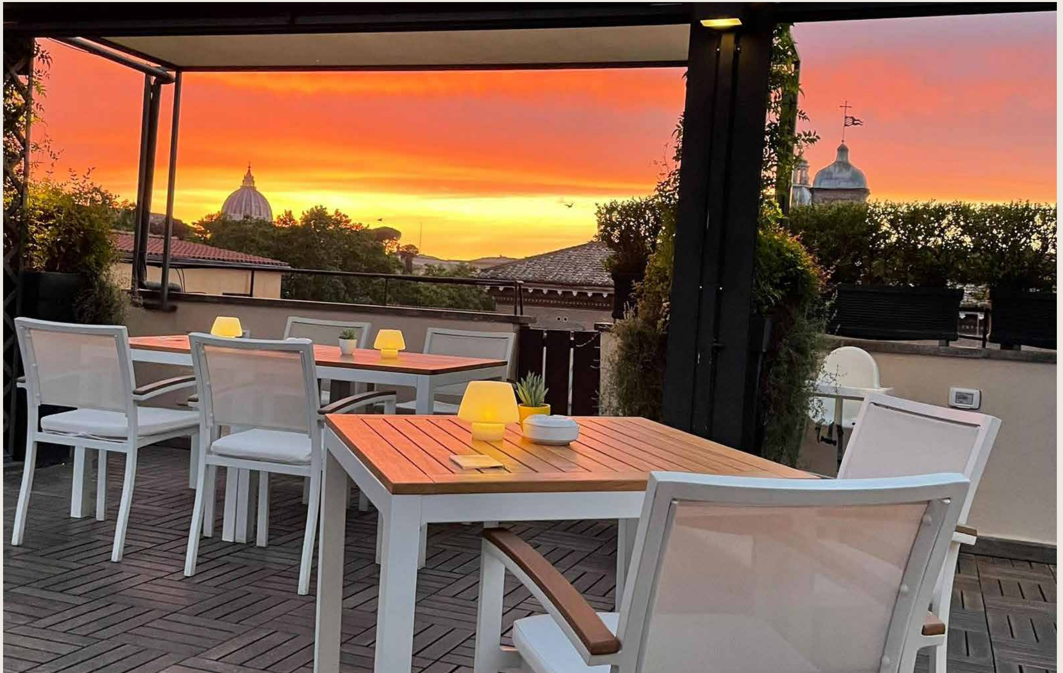
Roof Terrace at sunset