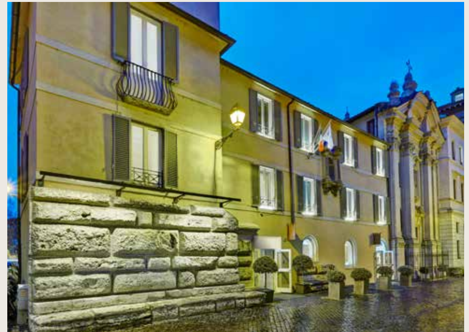
Hotel Exterior by night

He commissioned Donato Bramante, the designer of St. Peter's Basilica, to plan the new thoroughway and to create a centrepiece - the 'Palazzo dei Tribunali' - to be the hub of the city's justice system. This was never finished but the great stone seats, which are all that remain of the courthouse, have been incorporated into the Hotel Indigo Rome - St. George and are affectionately known as the 'Sofas' of Via Giulia.