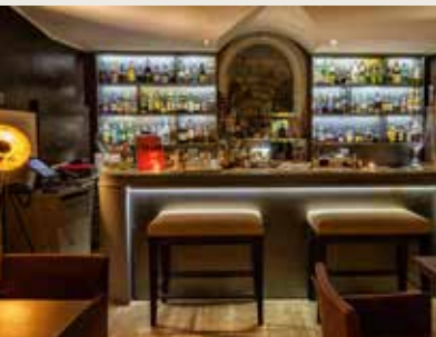
I Sofà Bar