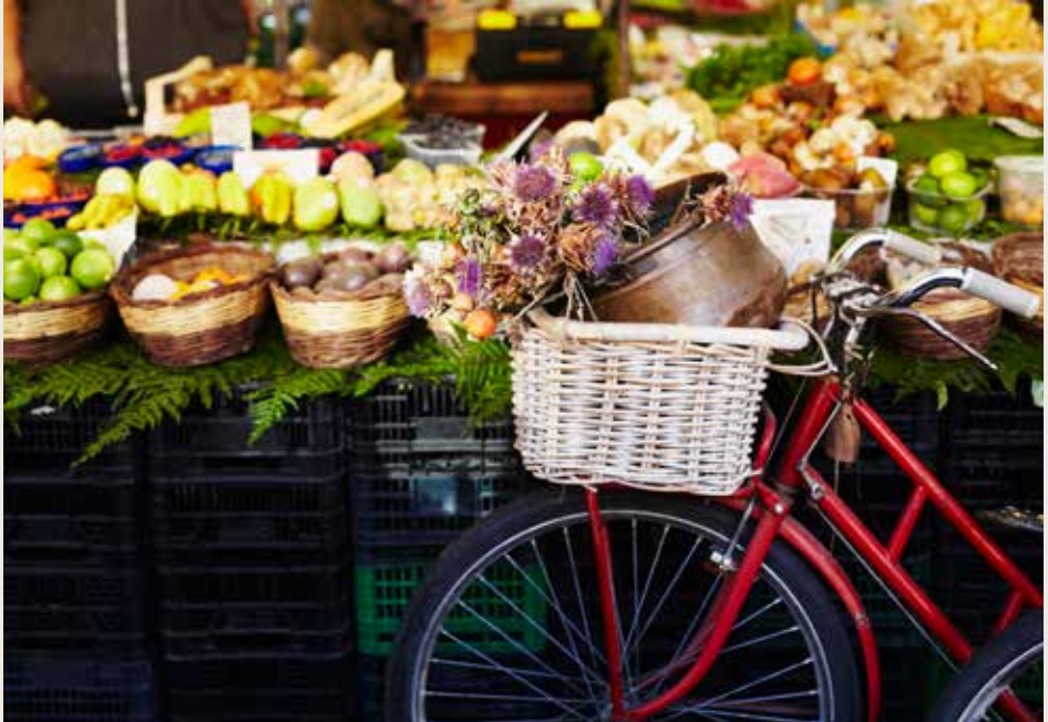
Campo de' Fiori Market

They seek the reliability and dependability of a globally recognised brand with distinct experience of a boutique.