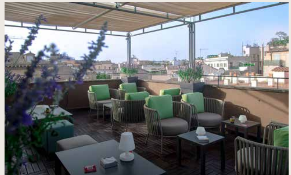
I Sofà Bar