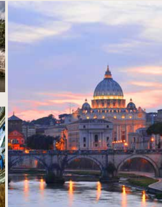
St. Peter's Basilica