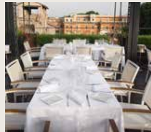
I Sofà Bar Restaurant & Roof Terrace