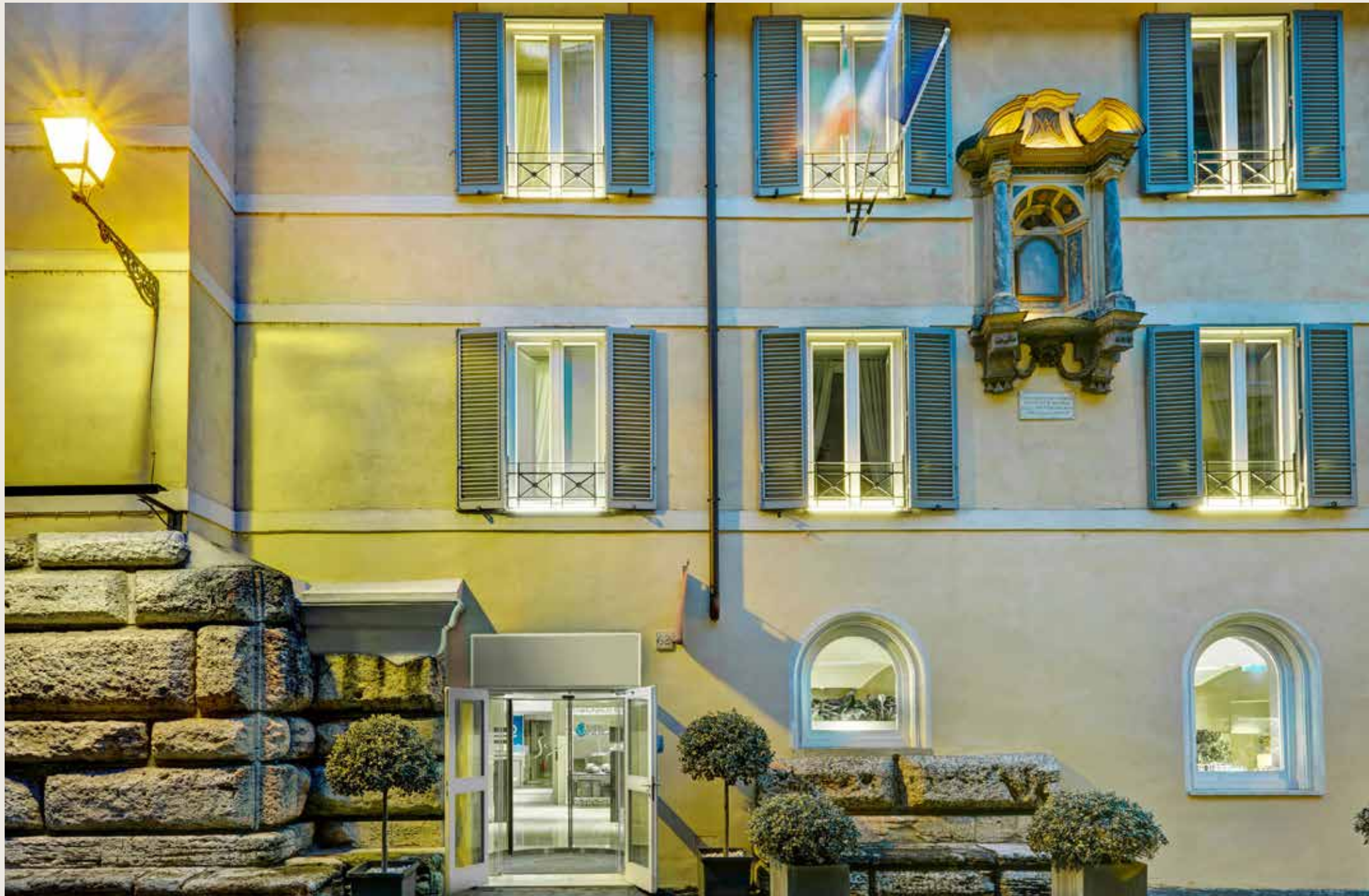
Hotel Exterior by night