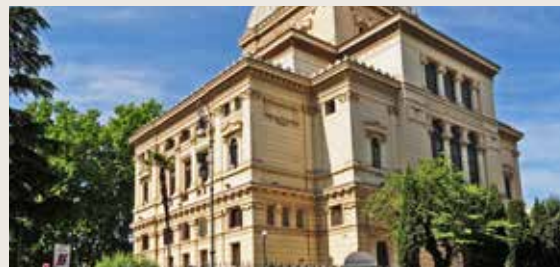
Synagogue of Rome