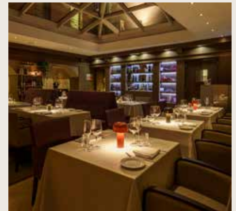
I Sofà Restaurant