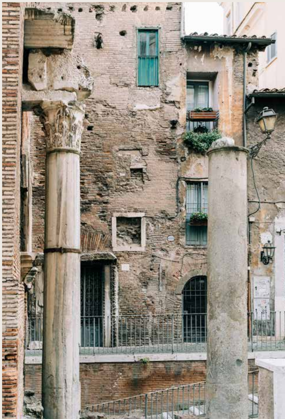
Portico d'Ottavia - Jewish Ghetto