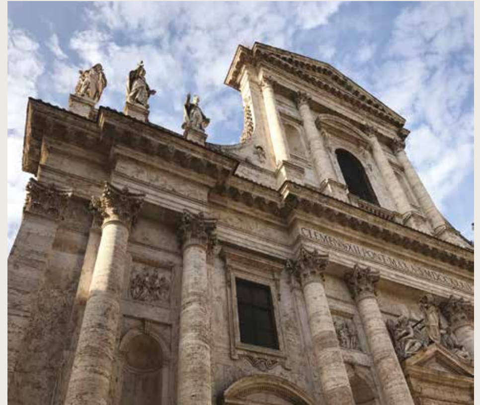
Basilica of San Giovanni dei Fiorentini